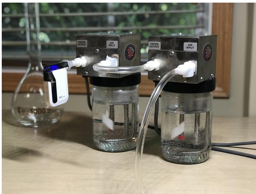
Figure 2: Breath simulator set-up