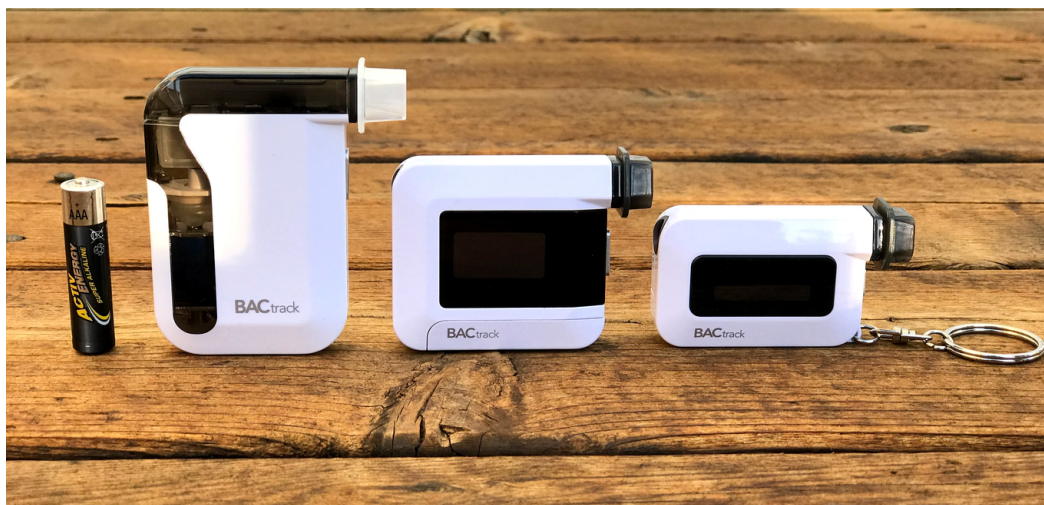
Figure 1: BACtrack® Pro, C8, and C6

Before testing, users must abstain from drinking alcohol for a period of at least 15-minutes. This allows for residual alcohol in the mouth from recent drinking to dissipate so as not to falsely elevate the test (18; 19; 20; 21; 22). The instruments do not have a mechanism to monitor for residual mouth alcohol, such as those used in more advanced infrared breath alcohol analyzers (23).